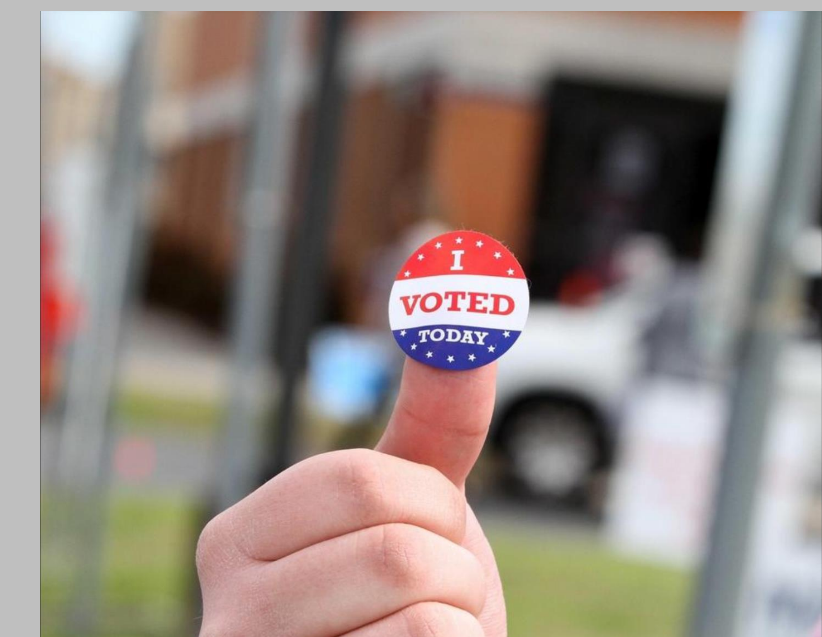
The flyers were passed out on March 3 rd , NC's Primary Election Day (3)

SNAP Benefits NC Flyer - customized by district - were passed out as part of the campaign.